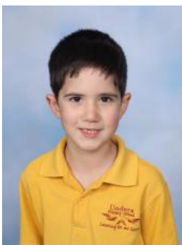
Lewis Lagana Foundation

For showing resilience when saying the sounds and writing a whole sentence independently!