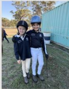
RALLIES 1 ST SUNDAY OF EVERY MONTH