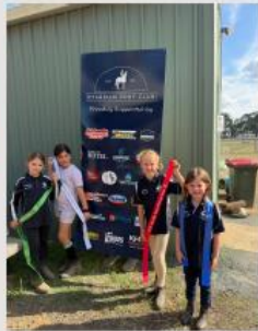
GROUNDS ARE AT KYABRAM SHOWGROUNDS & MOORA REC RESERVE